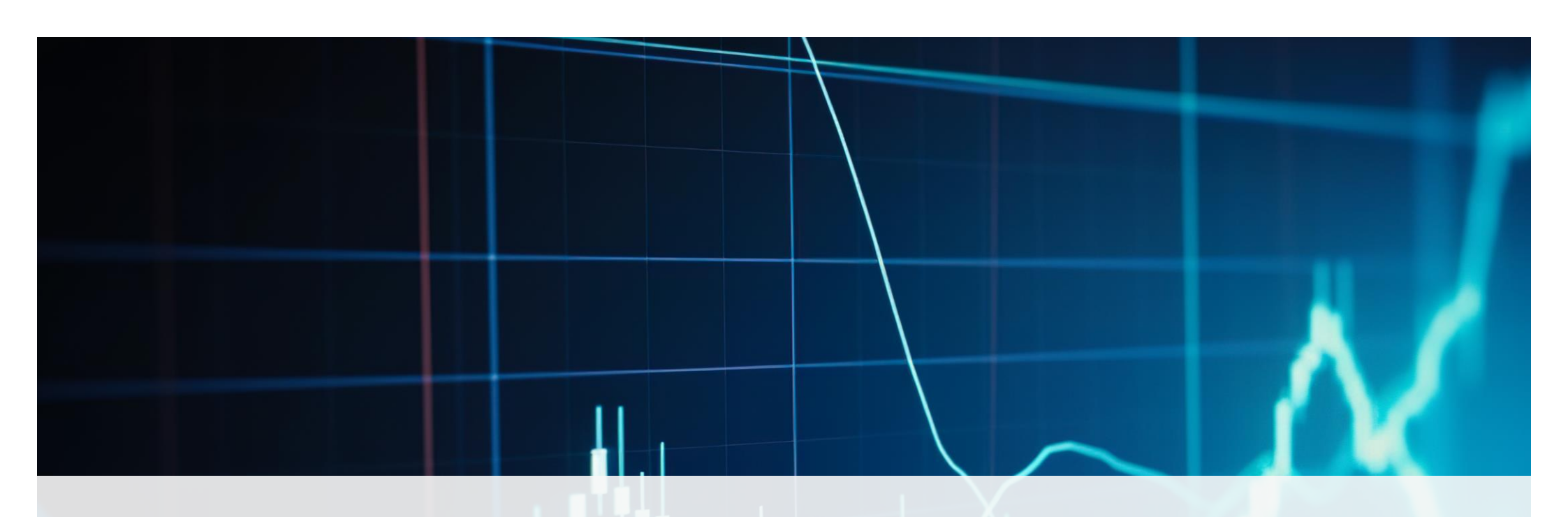
ANNEX 1: LEGISLATIVE PROPOSALS ON FINANCIAL SERVICES: 2019-24 COMMISSION